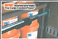
KIN10088 SAF-T-LOK BAR - ALUMINUM