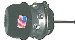
RNGBTS-3030 spring brake, type 3030, sealed, less clevis