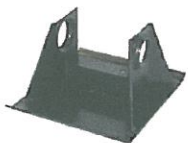
PEN05-300 Sand Shoe, 10"x 10" Flair with single gusset